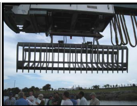
(Left) Giant pump (one of six) in the S5A pump station, (Center) Barrier to block debris from entering the pump station, and (Right) mechanical baskets that remove debris from the barrier.