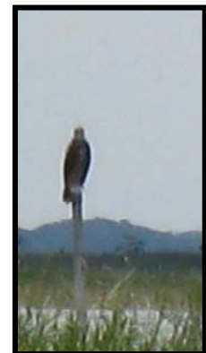
Surface mats of the invasive submersed plant, hydrilla, in Lake Tohopekaliga, FL (Center). The endangered Everglades snail kite sits on perch hunting apple snails (Right).