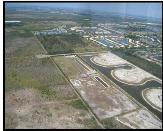
Aerial view of agricultural lands and flood control canals southwest of Lake Okeechobee (Left), and base of operations for the Lee County Mosquito/Hyacinth Control District in Fort Myers, FL (Right)