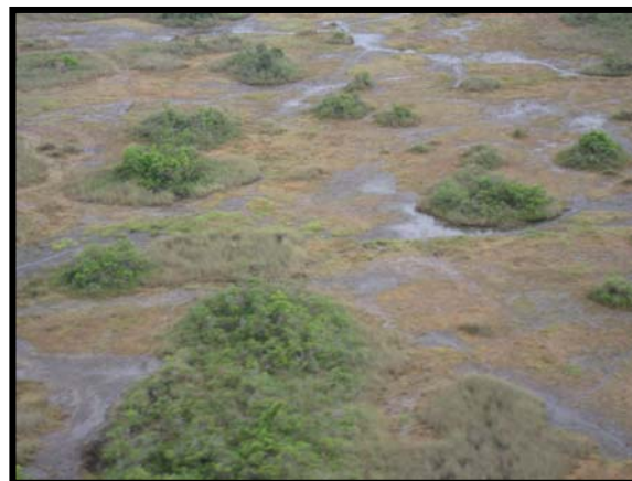
(Top Left) Stormwater treatment areas (STAs) adjacent to Loxahatchee NWR just west of Ft. Lauderdale, FL. These constructed wetlands filter excess nutrients from waters flowing from agricultural lands into the refuge and ultimately into the Everglades NP. (Bottom Left) Herbicide-treated melaleuca trees that had been felled by ground crews in preparation for burning at Loxahatchee NWR. (Right) Native tree islands within the sawgrass prairie of the NWR

4. Pump station S5A - Jim Galloway and SFWMD staff showed us the 2nd largest pumps in the world designed to move water from canals draining the surrounding agricultural area into the Everglades. The pumping stations are critical for managing storm runoff during the rainy season and hurricanes, often running 24/7 to keep surrounding areas from flooding. Aquatic weeds in the canals can clog the pumps and cause major breakdowns; therefore, timely plant management in the canals is critical for flood control. Mechanical baskets remove objects (garbage, debris, automobiles) and vegetation from water