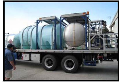
(Left) Helicopter used for aerial herbicide treatments by Helicopter Applicators, Inc.. (Center) Spray-boom and Microfoil spray nozzles used in helicopter precision applications of herbicides to control invasive vegetation in Loxahatchee NWR and other areas in south Florida. (Right) Specialized herbicide mixing truck with helicopter landing pad mounted above the water and mixing tanks.